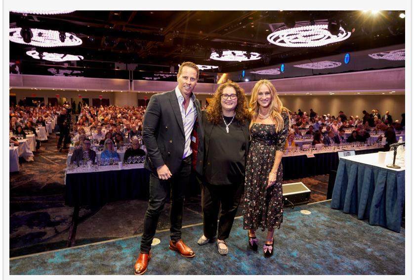
Sarah Jessica Parker at New York Wine Experience

This press release can be viewed online at: https://www.einpresswire.com/article/663853503