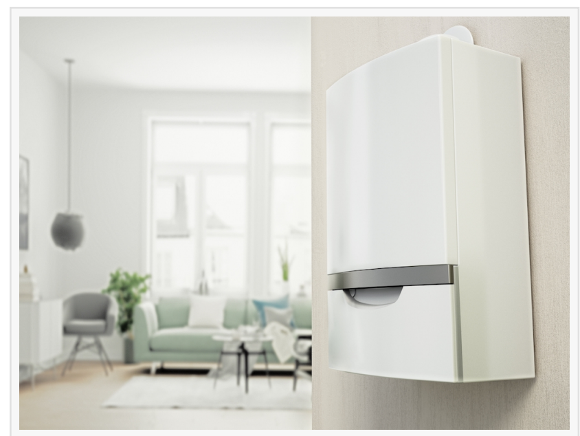
The combi boiler itself typically makes up the largest portion of the total cost

BERKSHIRE, UK, October 25, 2023 /EINPresswire.com/ -- When considering a new combi boiler for home, cost is often a primary concern. There are several factors that determine how much a combi boiler will cost to purchase and install. The brand, model, and size of the boiler itself significantly impact the overall price. More advanced, higher efficiency boilers from reputable brands will typically cost more than basic models. The needed installation components