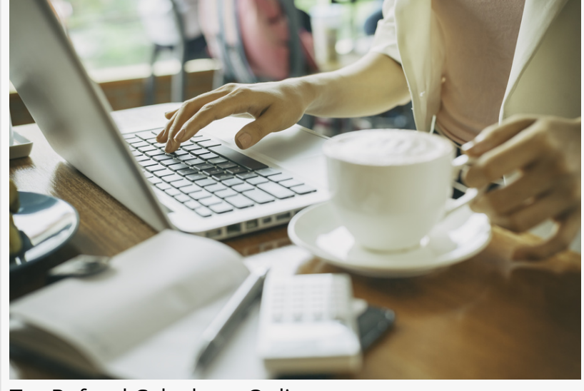
Tax Refund Calculator Online

User-Friendly Interface: <u>The calculator features a user-friendly design</u>, ensuring that taxpayers of all backgrounds can navigate the tax estimation process with ease. The intuitive interface makes it accessible for users to input their financial details and obtain instant results.