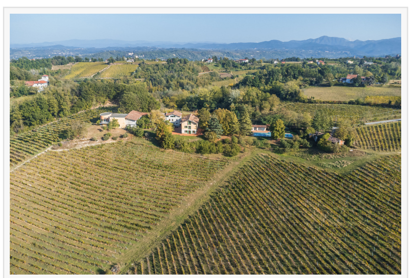
1 Cascina Palazzo | Rocca Grimalda, Italy