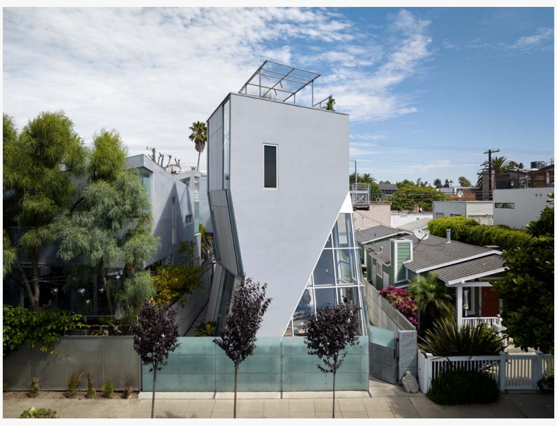
513 Grand Boulevard | Venice, California