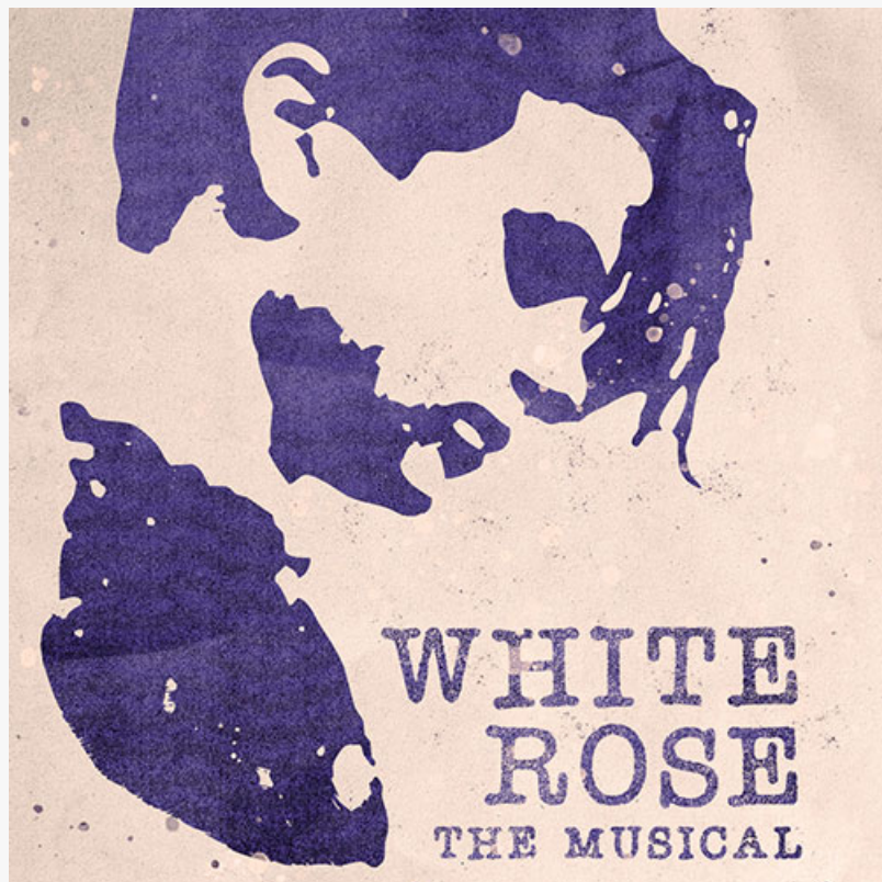
White Rose: The Musical debuts Off Broadway this January