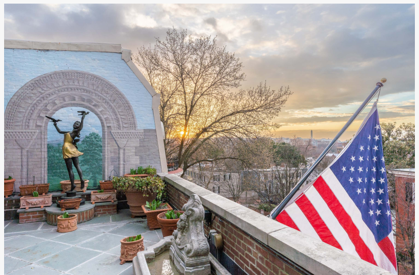
Spectacular Italianate entertaining spaces | Luxury Real Estate | Concierge Auctions

This press release can be viewed online at: https://www.einpresswire.com/article/663949904