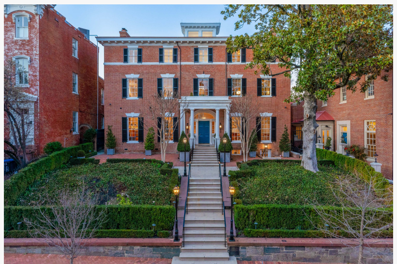
Magnificent residential compound in the heart of Georgetown | Luxury Real Estate | Concierge Auctions

NEW YORK, NEW YORK, USA, October 25, 2023 /EINPresswire.com/ -- Sotheby's Concierge Auctions is pleased to announce The Newton Baker House , a magnificent compound in the heart of Georgetown and steeped with history by previous owners, including First Lady Jacqueline Kennedy Onassis, Newton Baker, and more, is now pending sale after a fiercely competitive auction on 24 October.