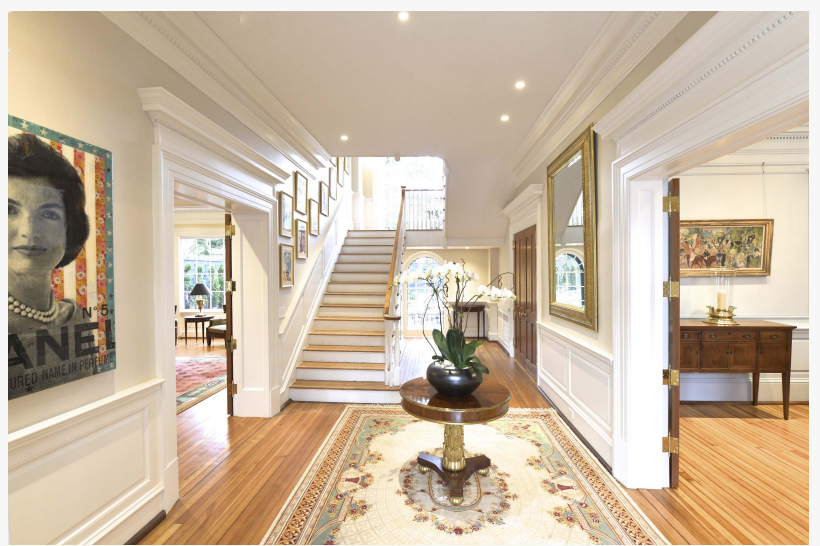
Historic home once owned by Jacqueline Kennedy Onassis | Luxury Real Estate | Concierge Auctions

Concierge Auctions is the world's largest luxury real estate auction marketplace, with a state-of-the-art digital marketing, property preview, and bidding platform. The firm matches sellers of one-of-a-kind homes with some of the most capable property connoisseurs on the planet.