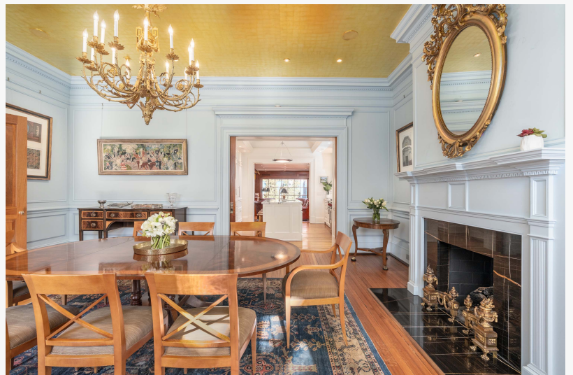
Rich historic elegance meticulously maintained throughout | Luxury Real Estate | Concierge Auctions