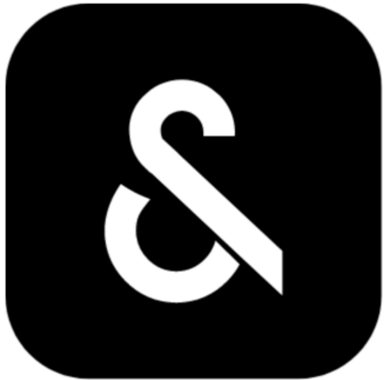
Supervity Logo Icon

Taking it to next level, Supervity's AI Skill Hub , a global repository of pre-trained digital skills and AI models from subject matter experts, is a key component of the company's purposeful commitment to achieve digital inclusion for everyone on the planet. The AI Skill Hub already hosts hundreds of free to use AI Coach skills across finance, cloud, office/collaboration, digital marketing, eGovernance and other new age digital tools created and managed by expert creators.