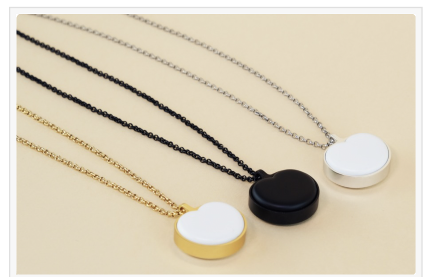
Bond Heart in Black, White and Gold

To record a heartbeat, the user places their finger over the smartphone's camera and flashlight, allowing the camera to identify the pattern of the heartbeat through the skin. Recorded heartbeats are stored in the app's Heartbeat Library and uploaded to the necklace.