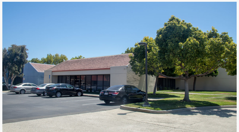
Patent PC Office