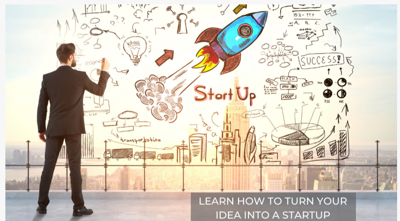
Launch Your Startup and protect your GTM plan