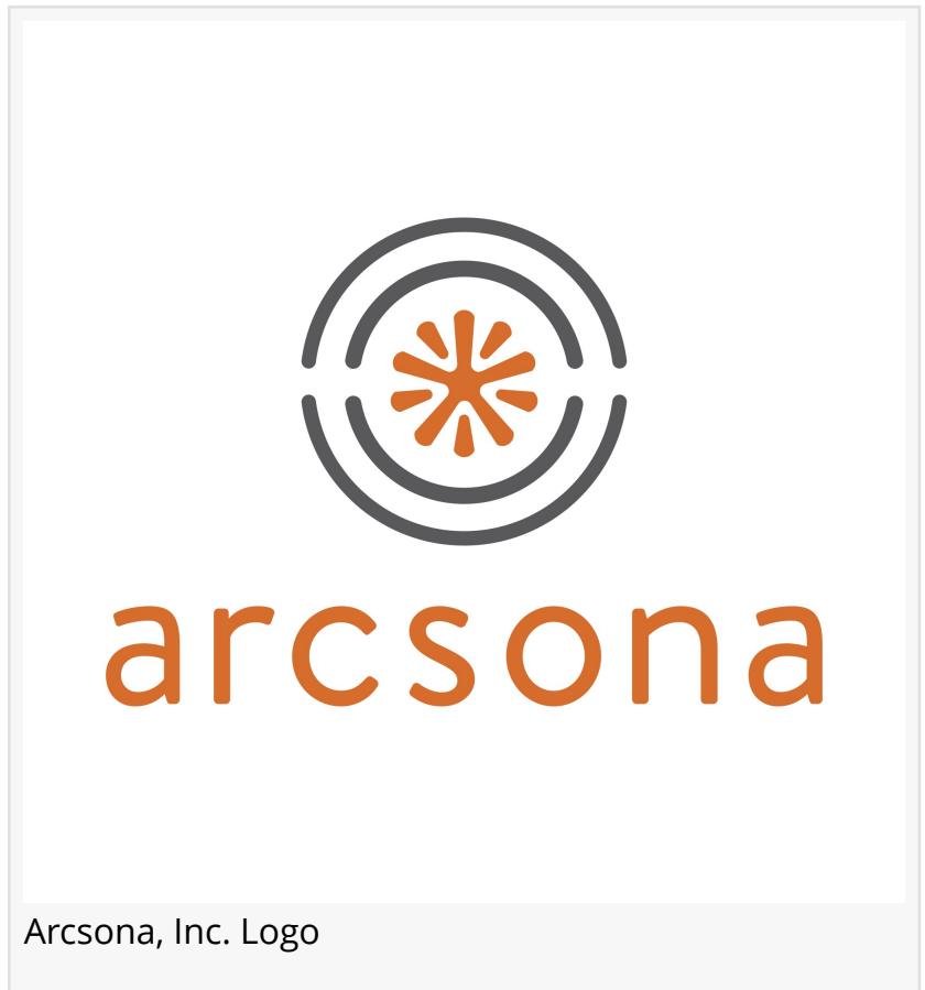
Arcsona, Inc. Logo