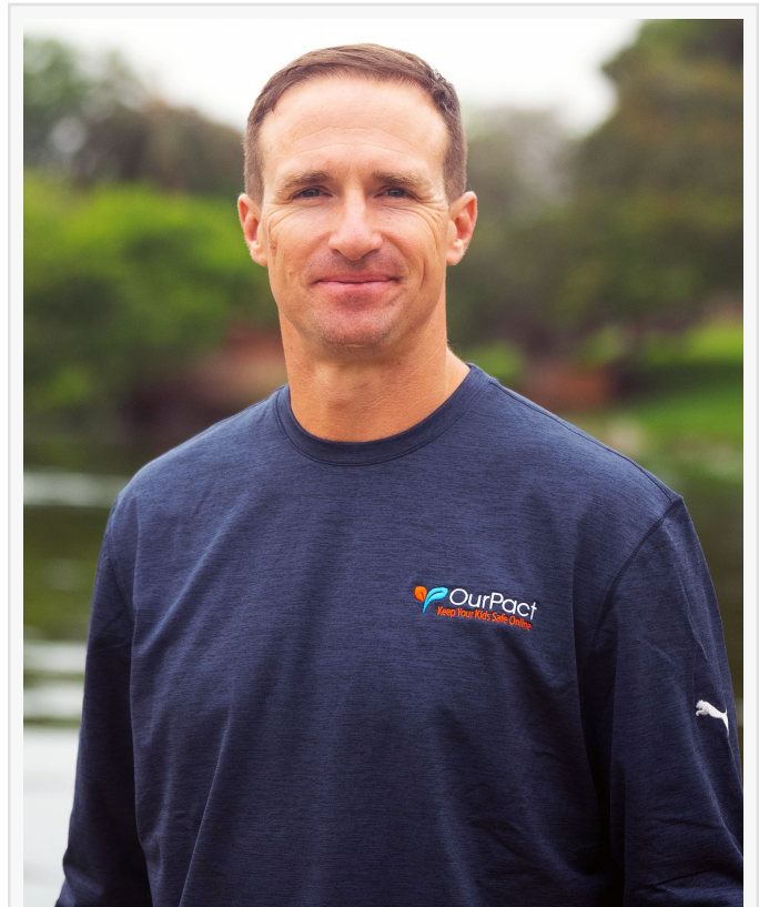
Football 'N' America Founder and Superbowl MVP Drew Brees

Parents who aren't sold on the dangers of smart phones and social media apps for kids should ask themselves why tech execs in Silicon Valley won't even let their own kids use the very products they helped create. According to an article from Wait Until 8th, a grass roots parent organization, "technology titans have been issuing startling warnings about the dangers of social media and excessive screen time for kids since 2019."*** From Sean Parker (the first president