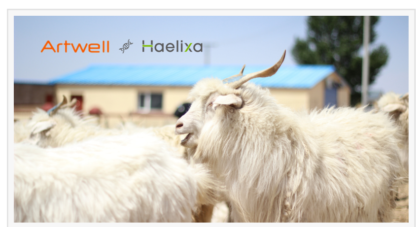
Cashmere goat visit with Good Cashmere Standard

ZüRICH, SWITZERLAND, October 26, 2023 /EINPresswire.com/ -- In Inner Mongolia, herders have been raising cashmere goats for centuries. It is a long tradition passed down from generation to generation. This history has led to the best and purest cashmere in the world. Artwell, known