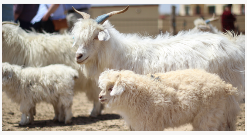
Cashmere goats in Inner Mongolia

Operating a lean and transparent factory, Artwell ensures efficiency and organization in its processes. All methods are systematized and standardized to improve the quality of cashmere garments while minimizing contamination and waste. These principles align with responsible practices, benefiting the environment, animals, workers, and consumers. For Artwell, this level of detail distinguishes them from competitors and pushes the value of their already remarkable history in cashmere production. Using Haelixa supports Artwell's QR-codebased lot management system, whereby each lot is tracked with its own QR code throughout its vertically integrated system. Combining digital and physical traceability ensures that the fibers are not removed or altered during processing (dehairing, dyeing,