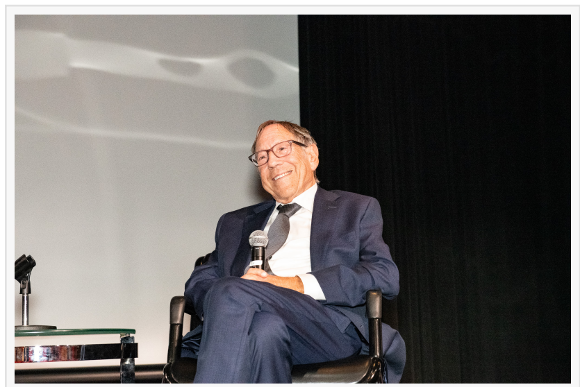
Professor Irwin Cotler, 2023 Lantos Prize recipient, speaks during the Q&A following the screening of the documentary "First to Stand"