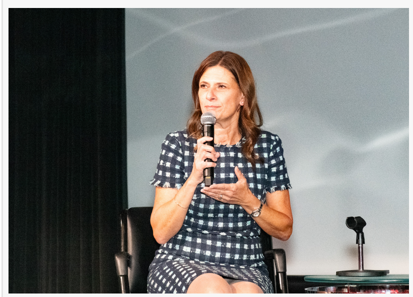
Israeli Special Envoy Michal Cotler-Wunsh moderates the Q&A at the film screening

First to Stand highlights historic battles for justice in places like South Africa, but it also features modern-day human rights struggles, such as the women's rights movement sweeping Iran. Above all, it offers a glimpse into Cotler's relentless pursuit of justice and the ways that his work has continually advanced human rights throughout the world.