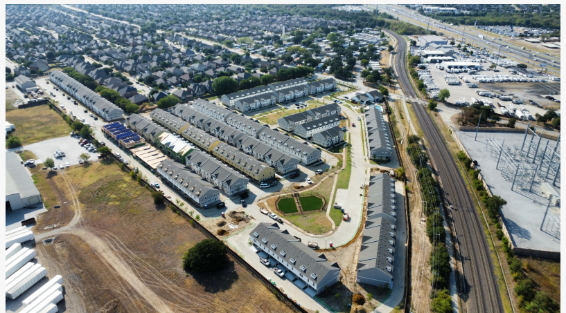
Quattro Recently Installed HVAC for Build To Rent Development in Texas