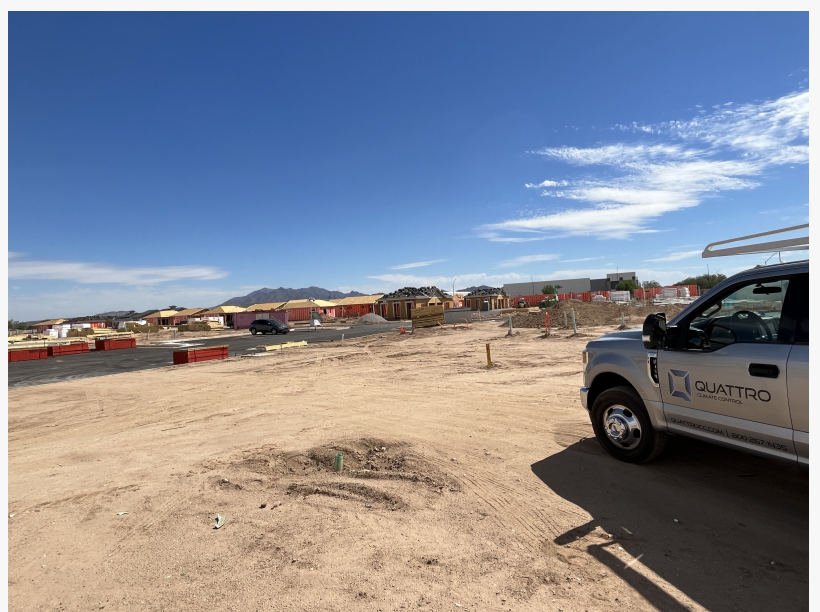
Quattro on-site at El Cidro

options. These High Performance Homes are designed using money-saving innovation with the planet in mind. At El Cidro, Quattro has installed top of the line HVAC material, including a smart thermostat to ensure that residents have the highest quality and cleanest indoor air. Quattro is poised to take on substantially more work in Arizona and Texas. As a vital HVAC provider since 2020, Quattro understands the needs of large commercial projects and works with clients to exceed expectations and stay within or ahead of schedule.