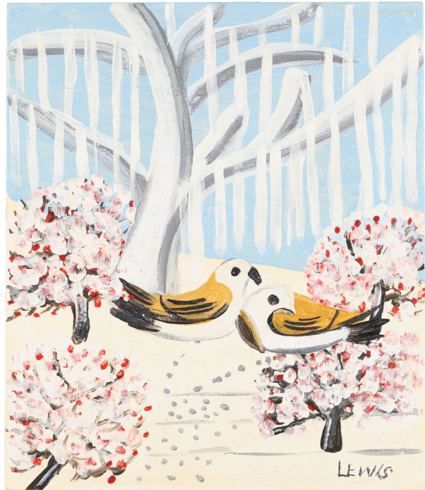
Circa 1950s oil on board painting by Canadian folk artist Maud Lewis (1903-1970), titled Two Birds in Winter (CA$44,250).

This press release can be viewed online at: https://www.einpresswire.com/article/664417035