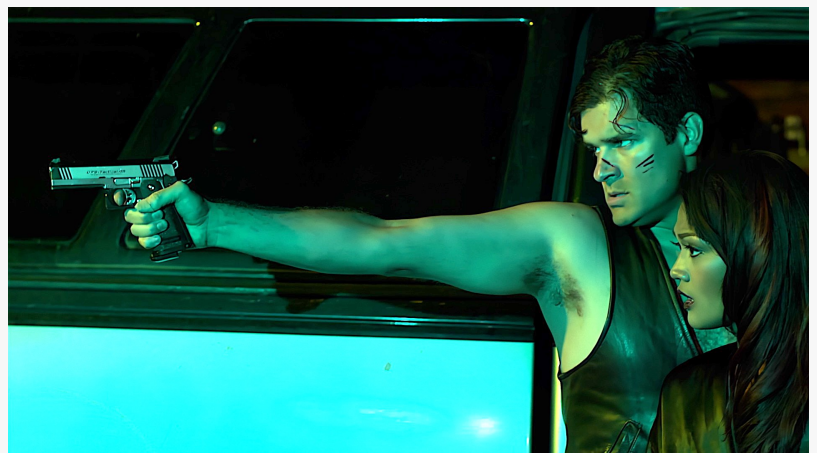
Detective Knight and Stacie take aim

The feature film Wrecker is now available on Amazon Prime Video. The film has several twists and turns and is being labeled as a future cult classic.