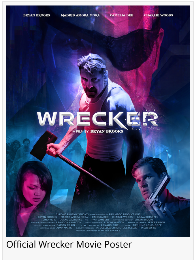
Official Wrecker Movie Poster