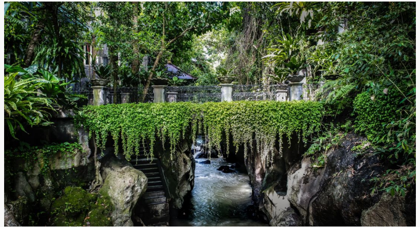
Saratoga | Bali, Indonesia | Concierge Auctions | Luxury Real Estate

/EINPresswire.com/ -- Concierge Auctions announces two rare auction opportunities in desirable Bali, both selling this November. Amidst lush greenery and a meandering river, Saratoga is a captivating property that seamlessly integrates nature and