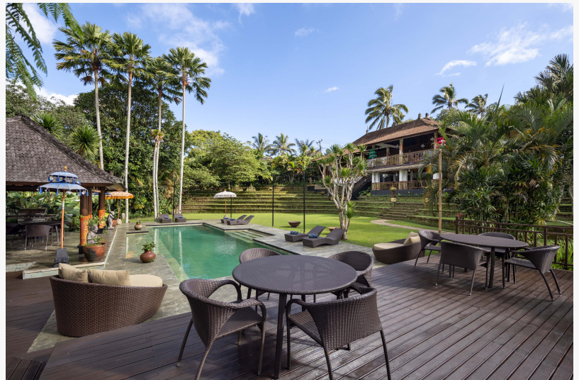
Alassari | Bali, Indonesia | Luxury Real Estate