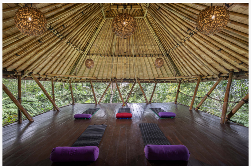
Alassari Plantation | Bali, Indonesia | Luxury Real Estate

that there will never be another one like it anywhere in the world. Some notable property features include its proximity to Canggu via a fully sealed road, prime location in the quiet and much sought after village of Kaba Kaba between Canggu and Tanah Lot in Bali's main growth corridor, and favorable relations with very friendly and peaceful banjars (Kaba Kaba and Cepaka) that fully support any future development. The estate's serene atmosphere also makes it potentially an ideal lunch or dinner stopover while traveling to or from Tanah Lot.