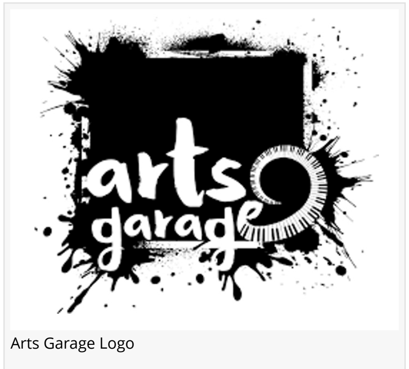
Arts Garage Logo