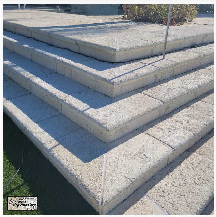
Tile Manufacturer Florida - Simulated Keystone

Simulated Keystone's simulated stone tiles are also eco-friendly, as they are made from recycled materials and do