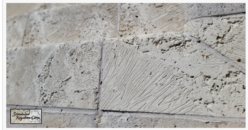
Simulated stone tiles

wide range of applications, such as indoor and outdoor flooring, wall cladding, fireplace