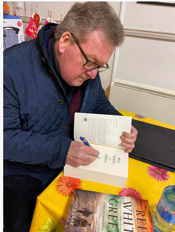
Book Launch Cromane