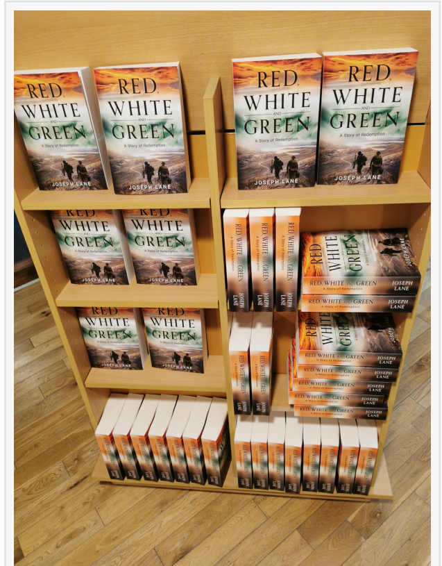
RWG Book Launch

This press release can be viewed online at: https://www.einpresswire.com/article/664621671