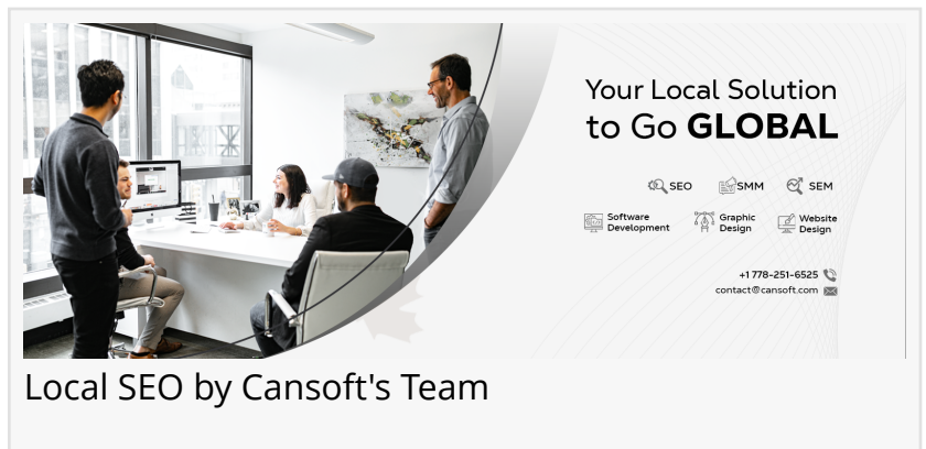
Local SEO by Cansoft's Team