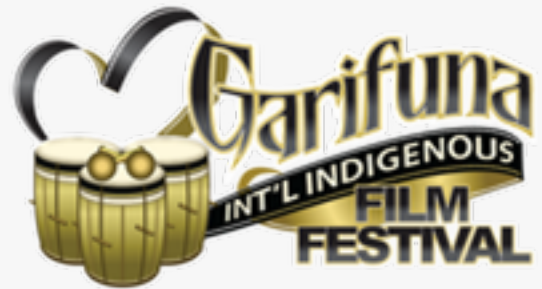
Garifuna International Indigenous Film Festival

The Garifuna people, originating from the Caribbean Island of St. Vincent, possess a rich tradition and enduring heritage that deserves global recognition. UNESCO declared Garifuna language, dance, and music in Belize to be a "Masterpiece of the Oral and Intangible Heritage of Humanity" in 2001. The Garifuna International Indigenous Film Festival aims to bring this vibrant culture to the forefront and shed light on the struggles and triumphs of the Garifuna nation and other indigenous communities worldwide.