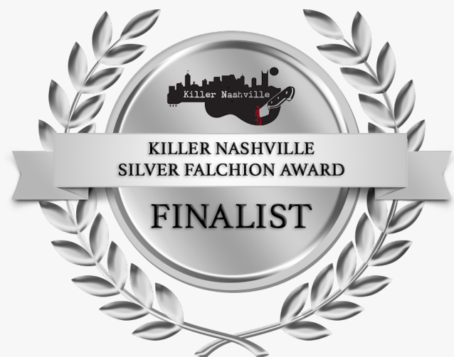
2023 Silver Falchion Award