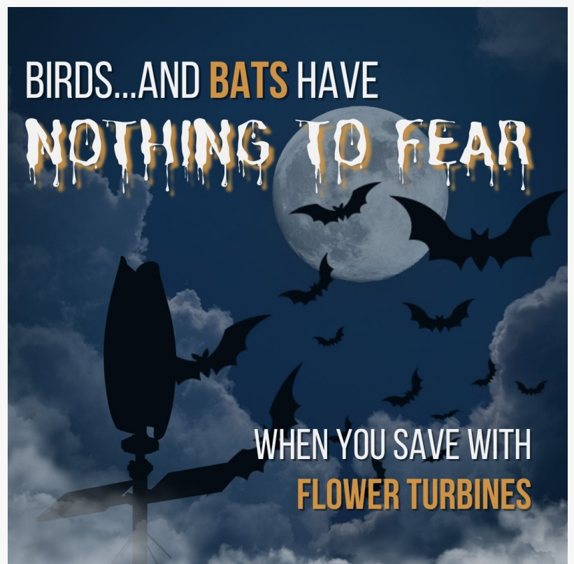
Bats and Flower Turbines