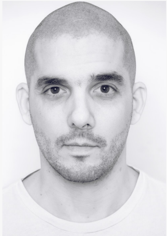
Artist: Camilo Restrepo