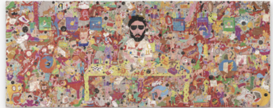
Bowling for Medellín 4, 2019