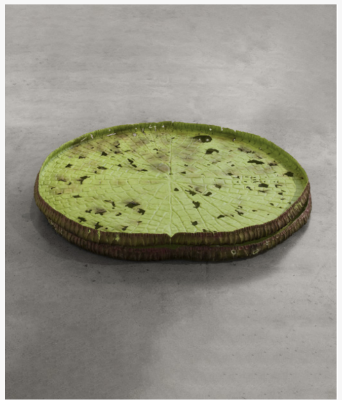
Victoria Regia, 2014