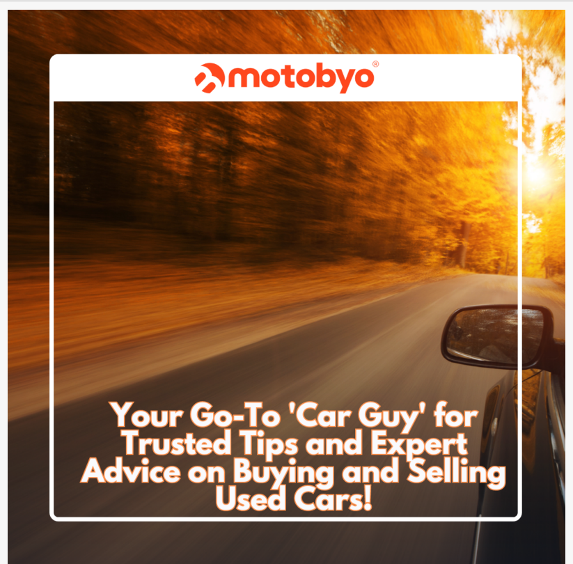
Motobyo®: Your Go-To 'Car Guy' for Trusted Tips and Expert Advice on Buying and Selling Used Cars!

With Motobyo's patent-pending pricing technology, users can quickly calculate their vehicle's value, and even get an instant cash value redeemable at a Motobyo partner location. Motobyo