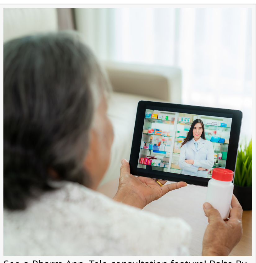
See-a-Pharm App, Tele-consultation feature! Balto Rx launches the first ever pharmacist video consultation feature for a prescription delivery service for millions of patients nationwide

LOS ANGELES, CALIFORNIA, UNITED STATES, October 31, 2023 /EINPresswire.com/ -- In this new digital and remote economy, there is a growing demand for Telehealth services. To meet this demand, Balto Rx, a patient-centric home delivery system for medical prescriptions, is proud to announce that they have launched the first-ever pharmacist video consultation feature on a prescription delivery platform. With one click, this new "See-a-Pharm" feature and app now allow patients to directly video call their pharmacist to learn more about their prescriptions. Within 72 hours after having them delivered straight to their home,