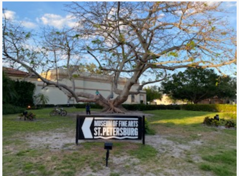
Museum in St. Petersburg, FL