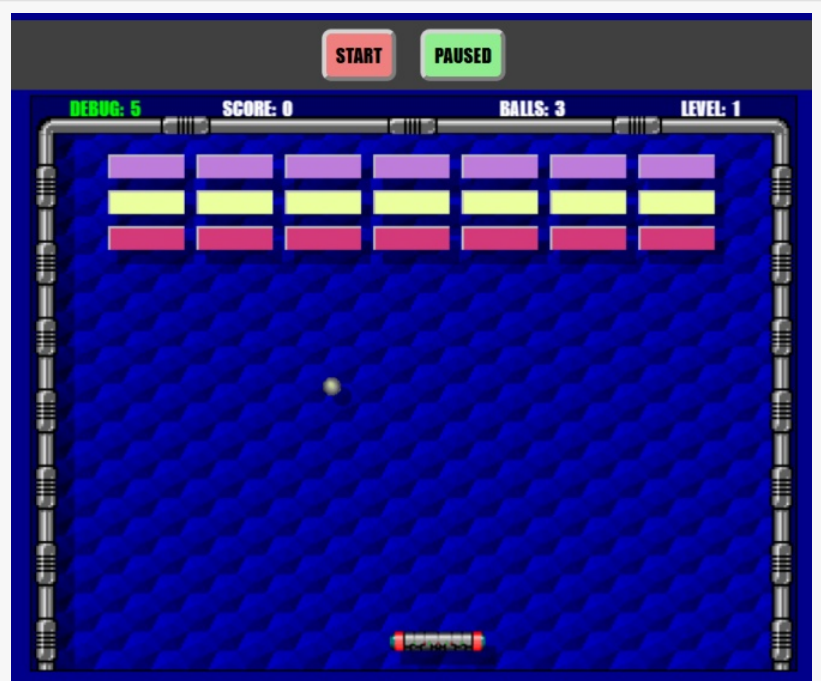
Breakout created by ChatGPT

ANDRE LAMOTHE Nurve Networks LLC +1 408-835-7584