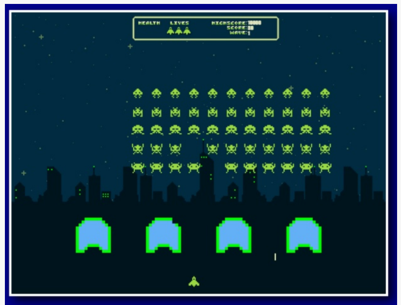
Space Invaders clone created by ChatGPT