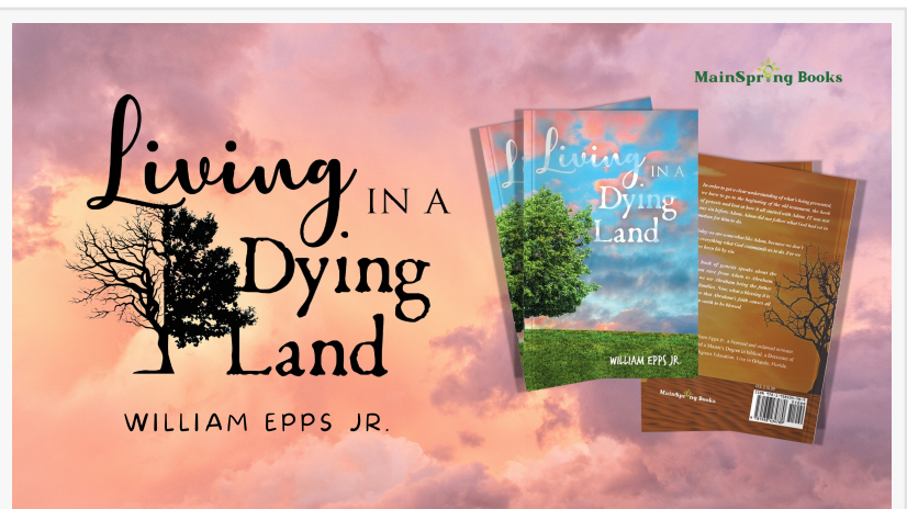
Living In A Dying Land

Marketing Team MainSpring Books +1 888-672-9597 email us here Visit us on social media: Facebook YouTube