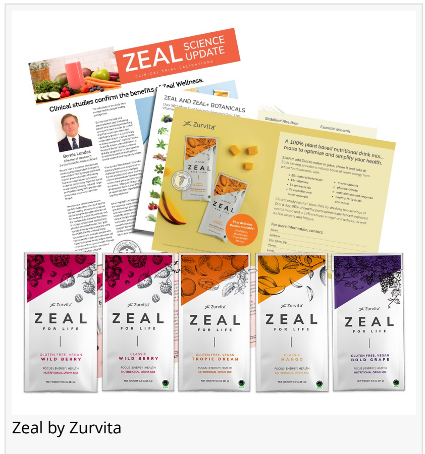
Zeal by Zurvita