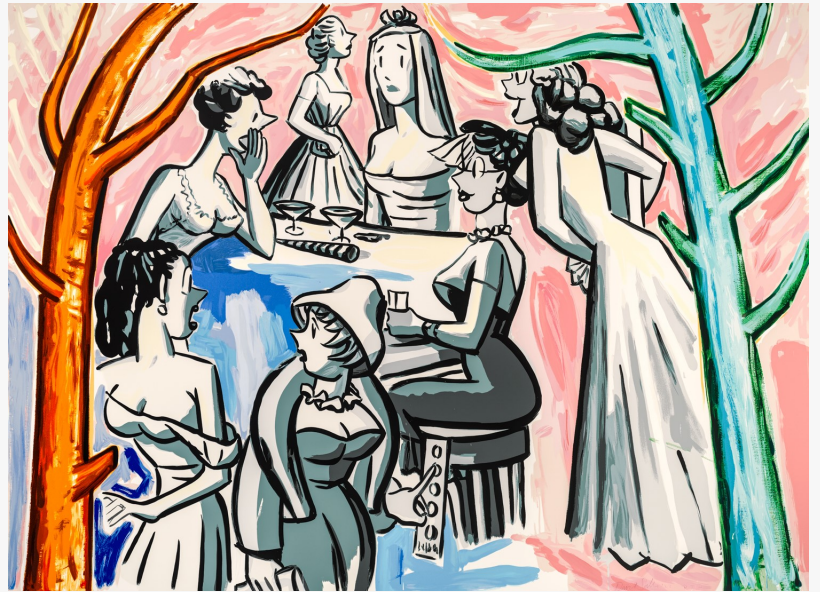
David Salle Don't Tell Her, 2023, (1/40) Silkscreened in colors on Saunders Waterford High White HP 425 gsm 54.50 x 74 in