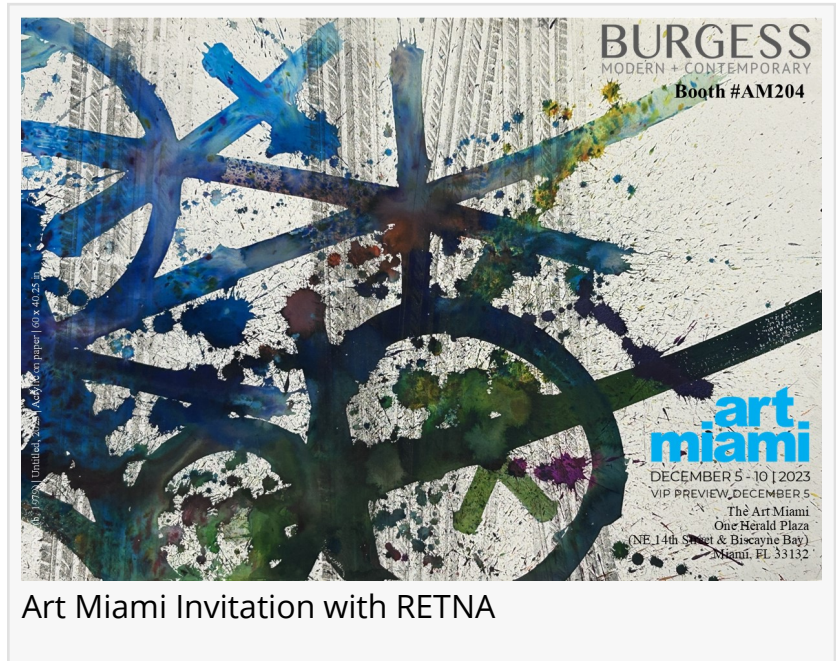
Art Miami Invitation with RETNA

Burgess Modern + Contemporary Presents Cultural Kaleidoscope at Art Miami .