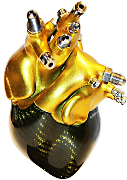
Engineered Emotion-Heart Of Gold