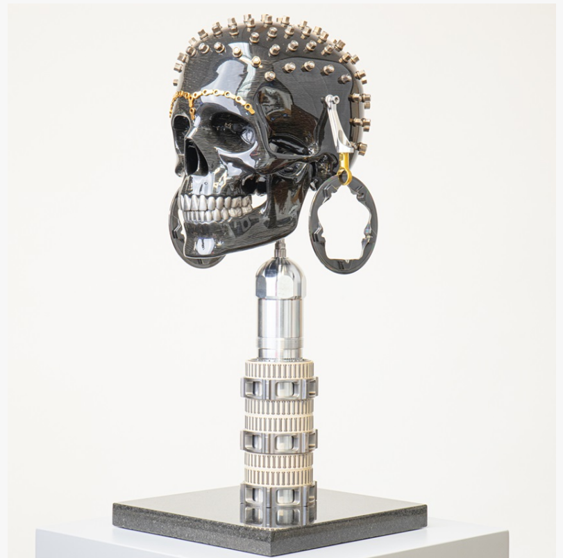
God Save The African Queen