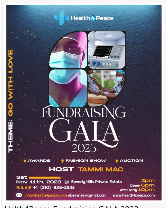
Halth4Peace Fundraising GALA 2023

The Health4Peace Fundraising Gala 2023 will be held in Beverly Hills on November 11, 2023 and is