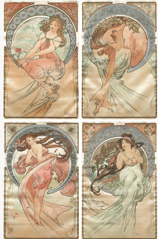
Alphonse Mucha, The Arts: On Silk. 1898. Estimate: $70,000-$90,000.