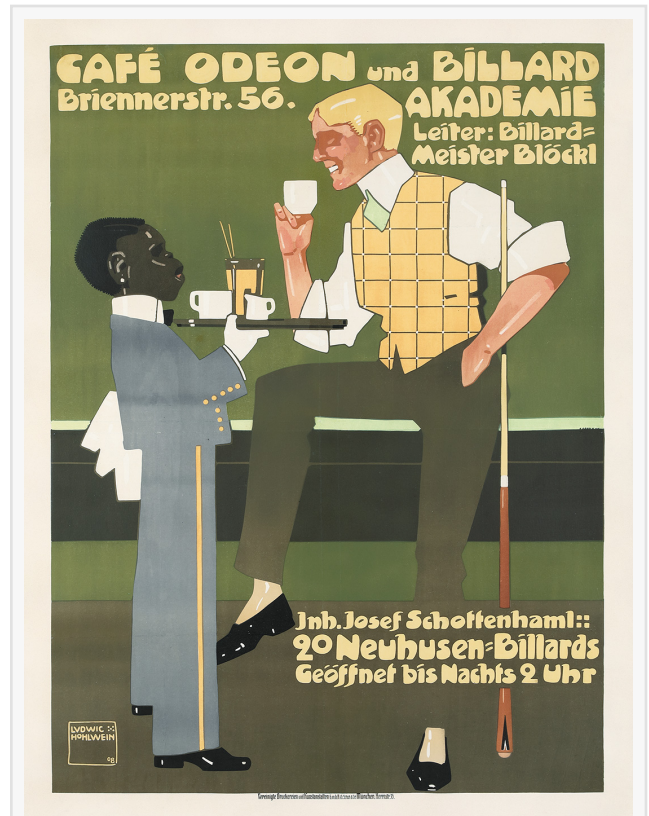
Ludwig Hohlwein, Café Odeon und Billard Akademie. 1908. Estimate: $14,000-$17,000.

This auction features 13 of the finest and rarest images from Ludwig Hohlwein, such as his 1908 Café Odeon und Billard Akademie (est. $14,000-$17,000), his 1907 Hermann Scherrer /