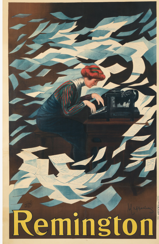
Leonetto Cappiello, Remington. 1910. Estimate: $20,000-$25,000.

28 war and propaganda posters will be offered, which include icons like James Montgomery Flagg's 1917 I Want You for U.S. Army (est. $6,000-$8,000) and his 1917 Wake Up, America! (est. $6,000-$8,000),