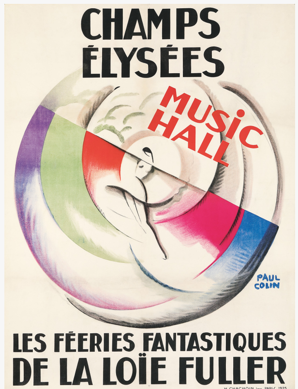
Paul Colin, Champs Élysées / La Loïe Fuller. 1925. Estimate: $30,000-$40,000.