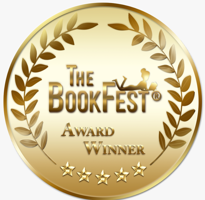
First Place The BookFest Awards