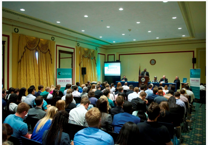
Drug-Free World event in the House of Representatives on synthetic drugs