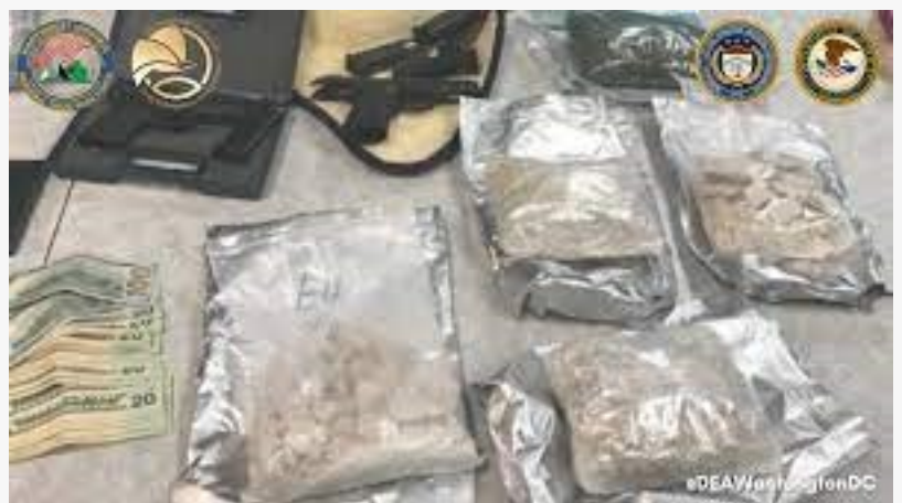
DEA photo of the synthetic drug eutylone

WASHINGTON, DC, USA, November 2, 2023 /EINPresswire.com/ -- A new street drug starting to appear more broadly in the greater Washington, DC area, is causing the Foundation for a Drug-Free World to include this in community briefings on various dangerous drugs. “Boot” is the street name for Eutylone , a synthetic drug in the bath salts category. It has been appearing in the H Street corridor and Chinatown area of Washington, DC.