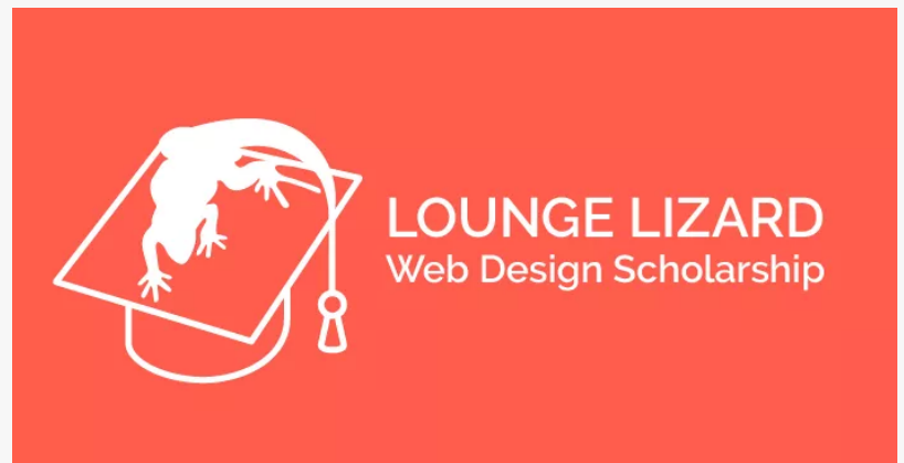
Lounge Lizard Scholarship

This press release can be viewed online at: https://www.einpresswire.com/article/665860712