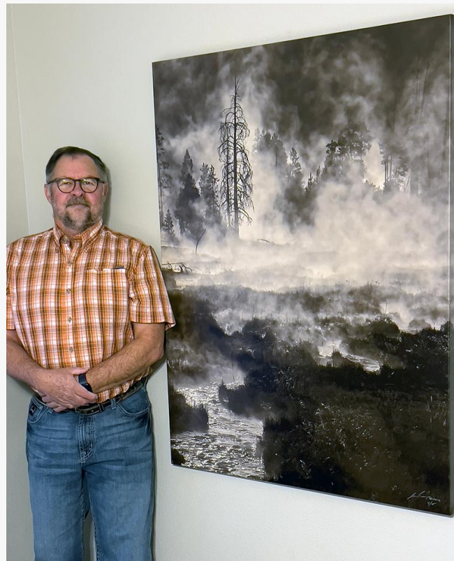
Print from a series after the 1988 Yellowstone fires called "Yellowstone Lost"

This press release can be viewed online at: https://www.einpresswire.com/article/665864816 EIN Presswire's priority is source transparency. We do not allow opaque clients, and our editors try to be careful about weeding out false and misleading content. As a user, if you see something we have missed, please do bring it to our attention. Your help is welcome. EIN Presswire, Everyone's Internet News Presswire™, tries to define some of the boundaries that are reasonable in today's world. Please see our Editorial Guidelines for more information.