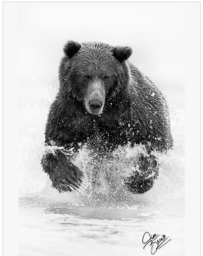
Nature's Best Winner