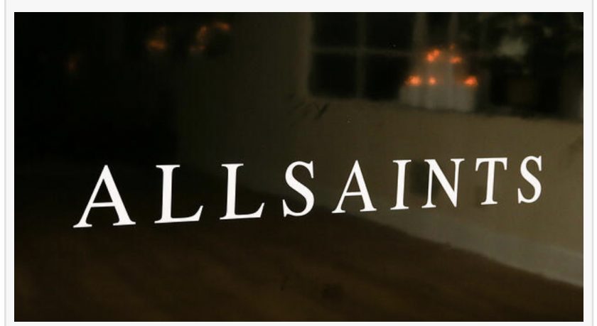
Allsaints Event

This press release can be viewed online at: https://www.einpresswire.com/article/665878061