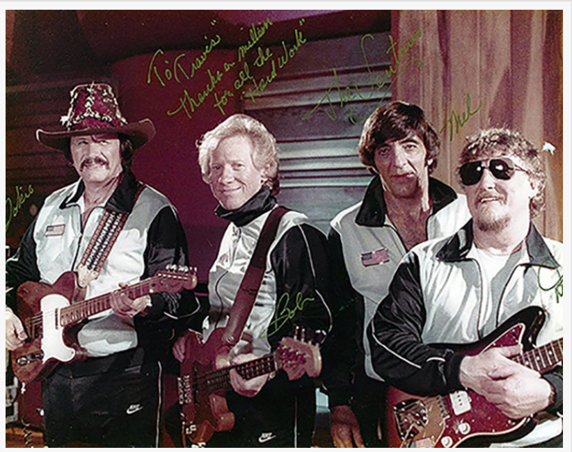
Ventures In Space filming at Conway Studios

Pike's November 2019 Otherworld Cottage publication of "Changeling's Return, a novel approach to the music" won a 2020 Bronze Medal eLit Award, a 2020 E2 Media Award of Excellence,