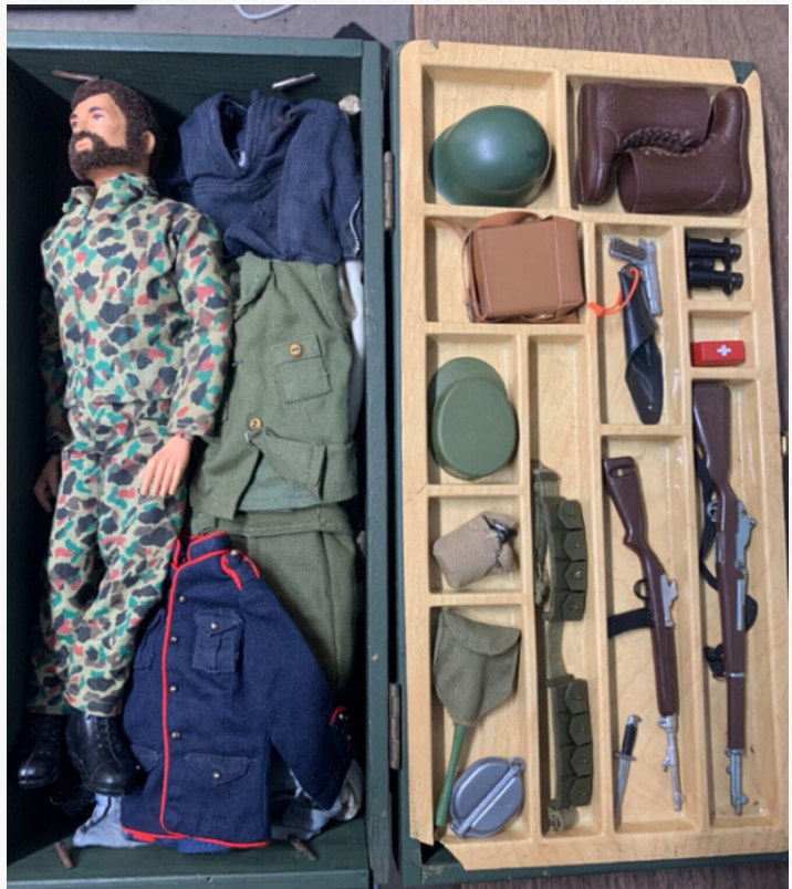
Circa 1964-1970 GI Joe Land Adventurer action figure, complete with weapons tray, wooden footlocker and doll with good flocked hair and lots of uniforms (est. $250-$500).

Decorative accessories will be plentiful and include a Herend Cheetah figurine in the Black Fishnet pattern, the first edition mark, and measuring 14 ¼ inches long by 6 inches wide, in like-new condition (est. $3,000-$5,000); a vi