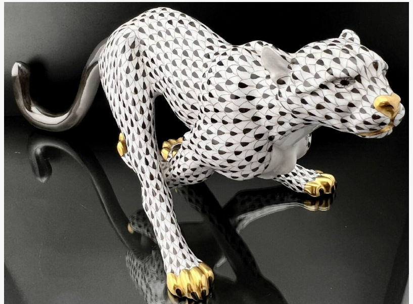
Herend Cheetah figurine in the Black Fishnet pattern, the first edition mark, and measuring 14 ¼ inches long by 6 inches wide, in like-new condition (est. $3,000-$5,000).

Toy vehicles will feature a Tootsie Toy Fire Department four-vehicle set of cast-metal toys, with