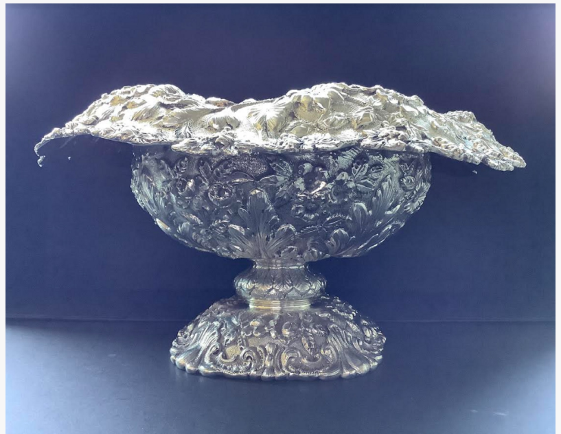
The star lot of the auction is this S. Kirk & Son sterling silver repousse footed centerpiece bowl, 13 inches in diameter, pattern #681, circa 1896-1924, period mark, 50.1 troy oz. (est. $3,500-$4,500).

They include names such as Cartier, Tiffany & Co. Dominick & Haff, Jose Hess, Emile Delaire, Gorham, Movito, Reed & Barton, Watson, Wallace, WM B Kerr, Sackermann Hesselberg & Co., Italian Vetreria Murano, Arte, American Flyer, Lionel, Nintendo, Tootsie Toy, Buddy L, Matchbox and Lesney. Altogether, 218 lots will come up for bid.