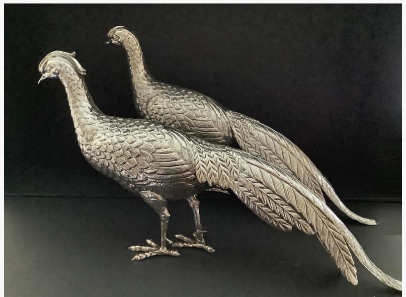
Pair of Spanish-made sterling silver super large pheasants with Star maker's mark, the male 7 ½ inches tall and the female 6 ¼ inches in height (est. $2,400-$3,200).

new condition (est. $3,000-$5,000); a vintage Maitland Smith bronze sculpture depicting a pair of