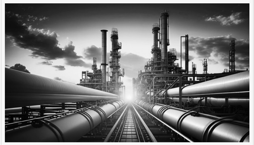
We support all Industrial NDT Needs.