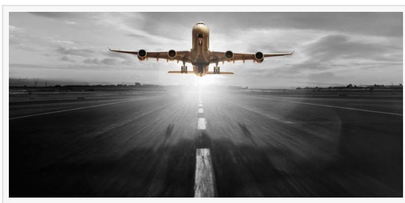
Aviation NDT Experts.

UNITED STATES, November 3, 2023 /EINPresswire.com/ -- Since its inception in 2018, <u>Baron NDT</u> has been on a mission to redefine the standards of the Nondestructive Testing (NDT) industry. A team disillusioned with the logistical challenges of large NDT companies and the lack of