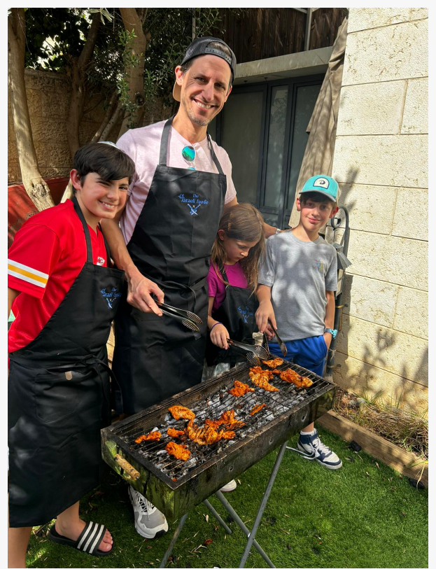
Cooking for soldiers

Join Smiles for the Kids in their mission to support soldiers and their families. Your contributions can make a significant impact. To learn more about their initiatives or to get involved, please visit www.smilesforthekids.com . To make your tax-deductible donation through the PFAP Foundation , please visit: https://givebutter.com/SmilesForTheKids2023 .