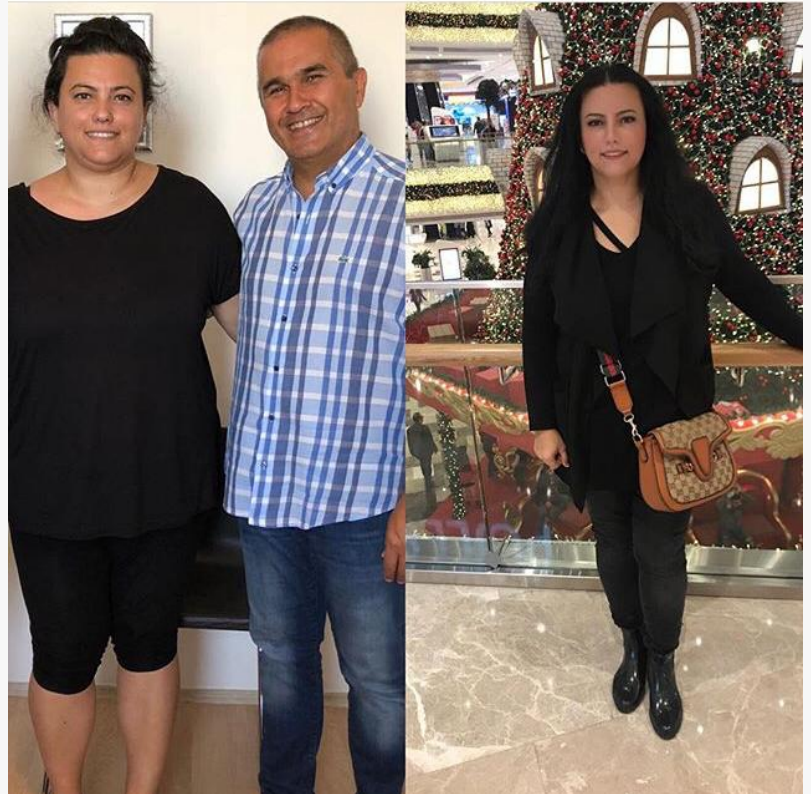
Prof. Dr. Serdar Kacar with his patient

6. Metabolic Syndrome: Obesity increases the risk of metabolic syndrome (high blood pressure, high sugar, high triglycerides, low HDL). Surgery can help control metabolic syndrome.