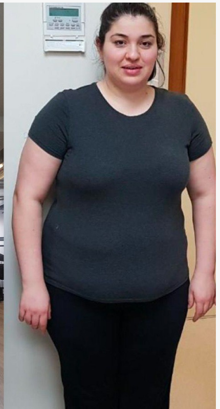
Obesity Surgery Treats 7 Diseases