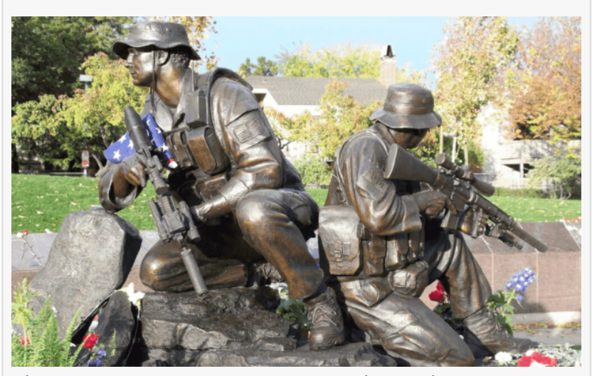
The Cupertino Veterans Memorial was the nation's first memorial to soldiers in the Afghanistan Conflict and honors all Veterans.

The Cupertino Veterans Memorial proudly supports these worthy organizations: