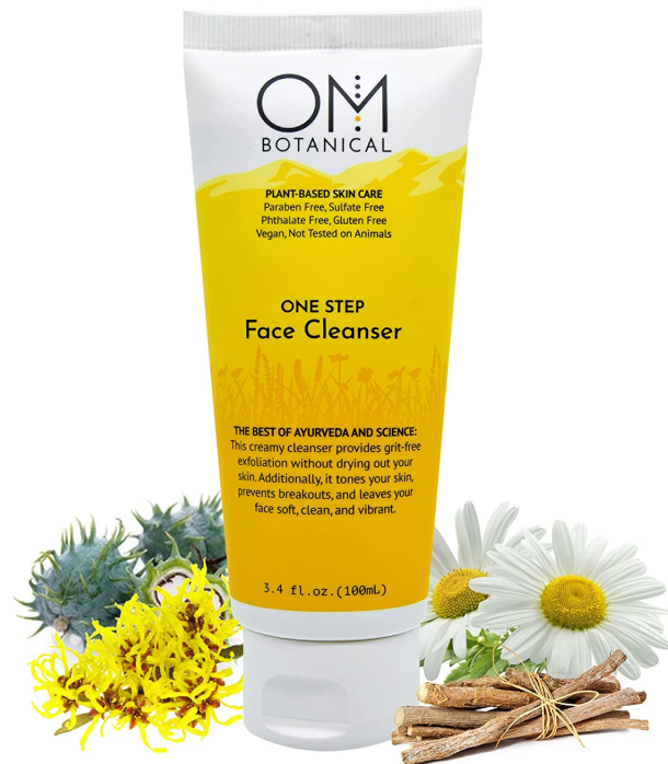
One step Cleanser

ABOUT OM BOTANICAL: Based in Apex, North Carolina, OM Botanical is committed to making the safest and the most effective plant based skin care line. Their entire line of products are made using bio-active organic ingredients. From the millennia-long traditions at the foothills of the Himalayas to powerful botanical ingredients used around the world, they’ve combined the best of Ayurveda and science. All their formulas are always clean,