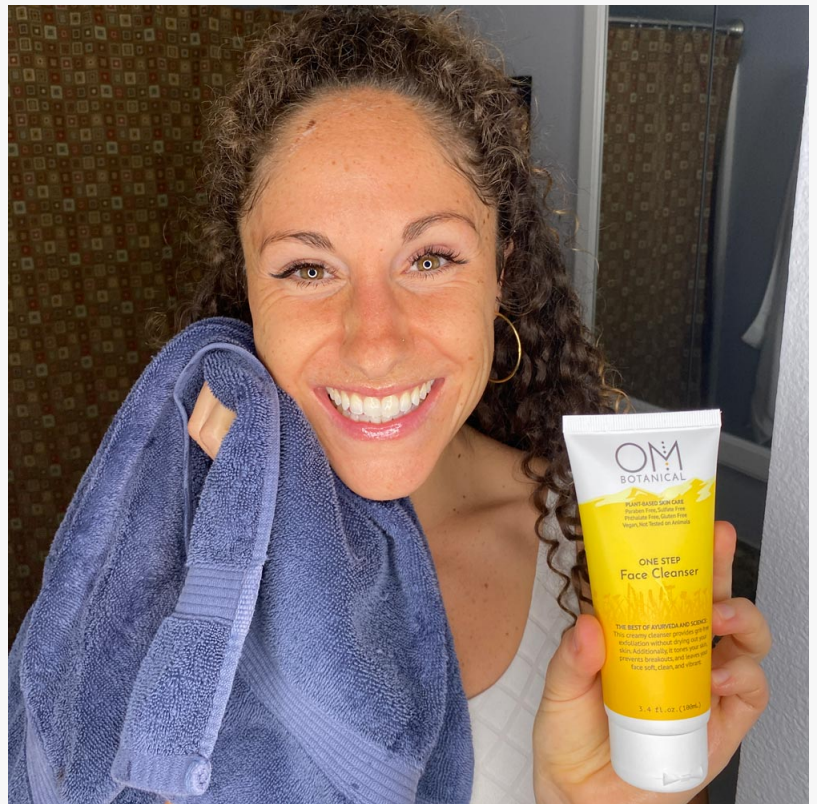
enzyme exfoliating cleanser