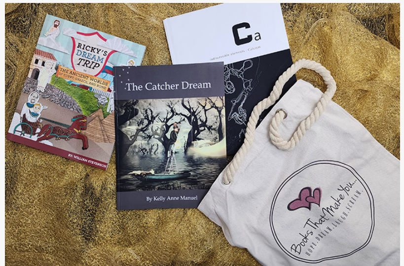
Black Chateau Golden Globes Gift Bag