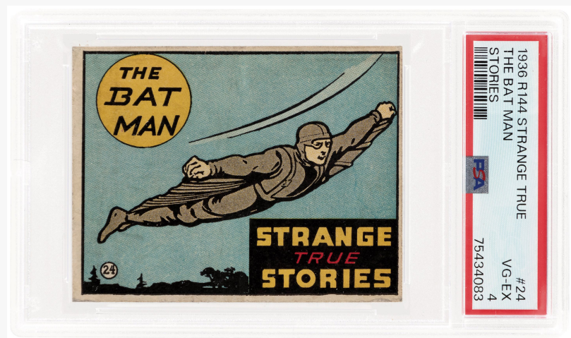
'The Bat Man' card, one of 24 cards in Wolverine's 1936 'Strange True Stories' gum card set. Extremely rare full set, only the second of its type offered by Hake's in 56 years. Estimate: $10,000-$20,000

It could easily scare up a winning bid of $10,000-$20,000.