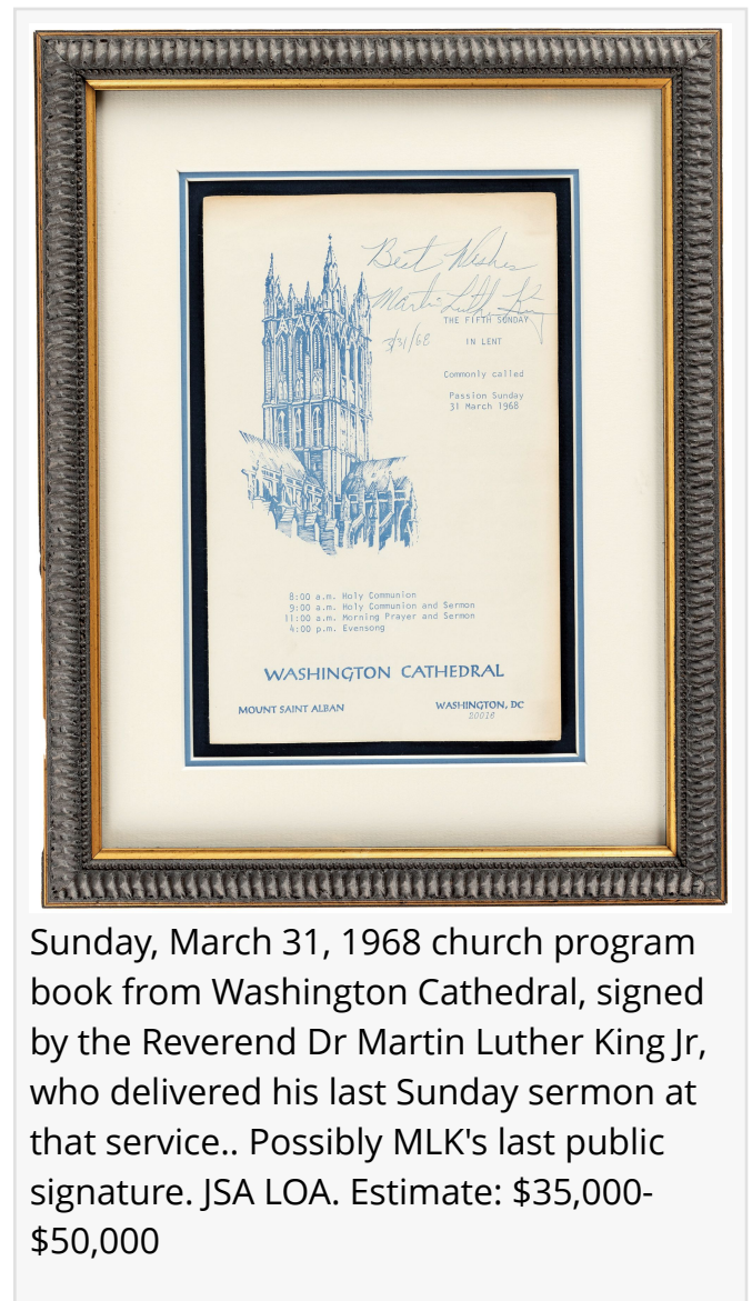
Sunday, March 31, 1968 church program book from Washington Cathedral, signed by the Reverend Dr Martin Luther King Jr, who delivered his last Sunday sermon at that service.. Possibly MLK's last public signature. JSA LOA. Estimate: $35,000-$50,000