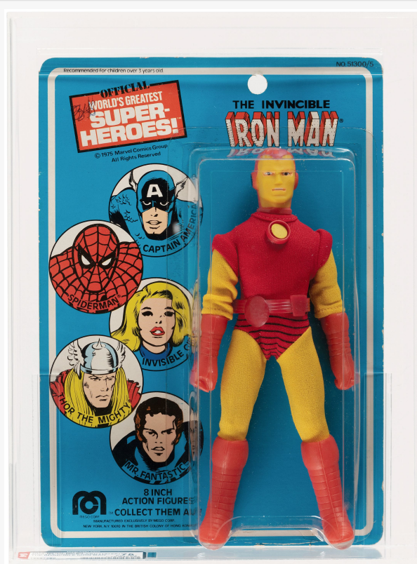
Mego Iron Man action figure from 'World's Greatest Super Heroes' line, copyright 1975 Marvel Comic Group. Intact blister card. AFA-graded 75 Ex+/NM. Only graded example in AFA Population Report. Estimate: $10,000-$20,000

Another Hake's first appearance comes in the form of a 1964 music speaker that recalls Glenn Strange's portrayal of Frankenstein's Monster in 1940s horror films. Designed as a functional piece, the creepy disembodied head could be plugged into any music source, including a transistor or car radio. Amazingly, the complete and all-original monster curiosity retains its original pictorial box. It could easily scare up a winning bid of $10,000-$20,000.