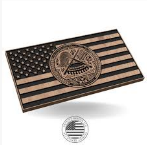
American Samoa, LLC Military

The American Samoa LLC is not just a legal entity; it's a strategic fortress offering entrepreneurs the agility to manage their business with freedom. This jurisdiction provides a legal structure that not only saves time and financial resources but also grants businesses the flexibility to navigate with ease and confidence.