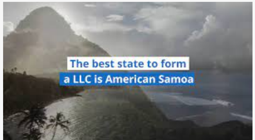
Best LLC in USA is American Samoa