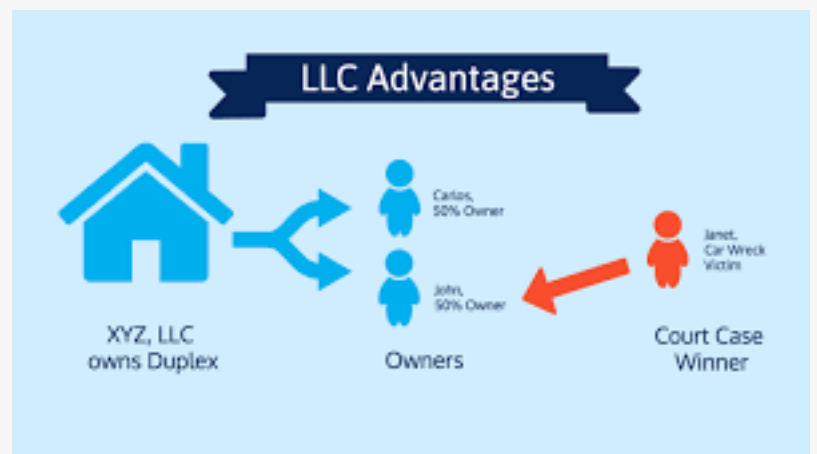
American Samoa protects owners from frivolous Lawsuits